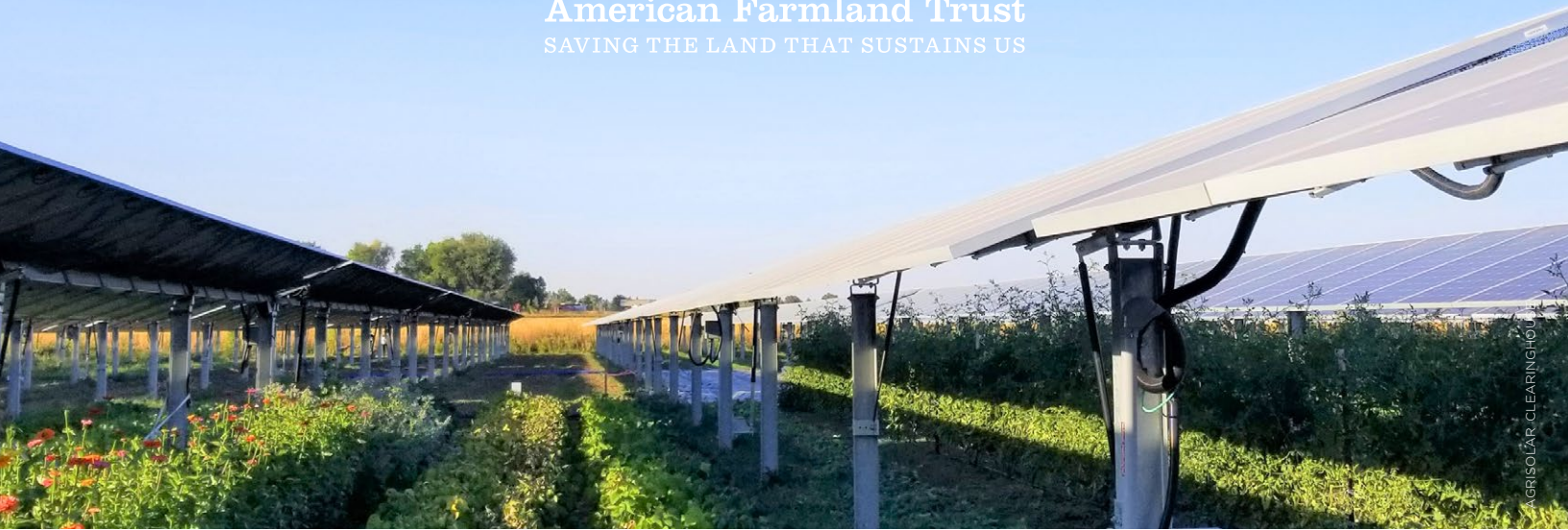
AGRI SOLAR CLEARINGHOUSE