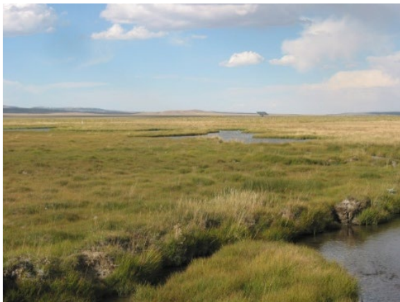
Healthy riparian/wet meadow habitat