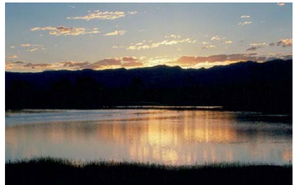
Ray Lake wetland restoration