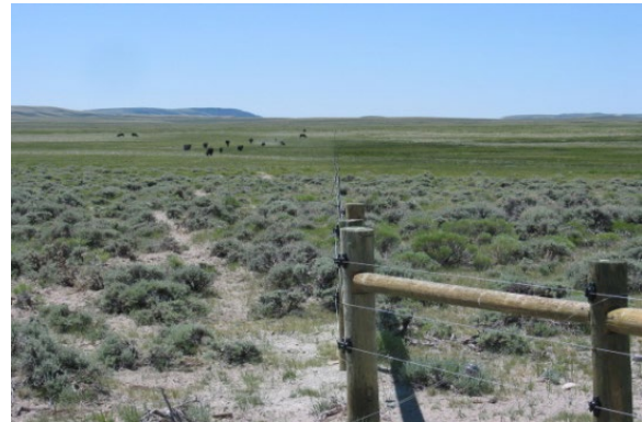
Upland & riparian grazing management project